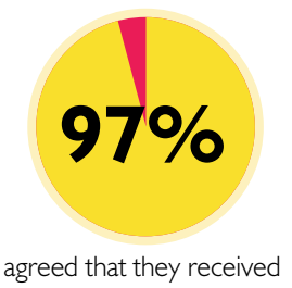
the materials in a timely manner