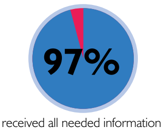
and materials to conduct a successful training